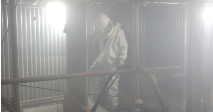
IGS HVTS technician preparing for application

This 50m 2 HVTS alloy cladding sample application has performed as expected and prevented any further erosion damage in that area, while the unprotected adjacent regions continued to degrade.