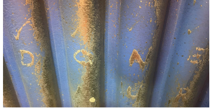
IGS HVTS inspection - no remedial action required

IGS inspected the HVTS alloy cladding in units 1 and 2 using exhaustive Magnetic Lift-Off (i.e., MLO), Visual Survey, and MLO SEE report. The condition of the existing cladding in both units was found to be in excellent overall condition.