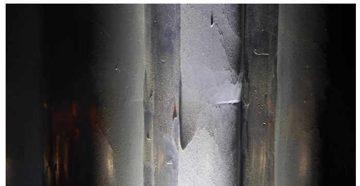
view inside the CFB boiler - erosion damage on the membrane

IGS mobilized a team to site for the 2019 application and the 2020 inspection, engineering work, and 2nd cladding application. Ed Griffith, IGS CFB Boiler SME, commented: "We picked the worst affected area to make sure the sample is representative and showed them how to perform grinding and mechanical repair, prior to application, correctly. We then inspected this sample after one year in service."