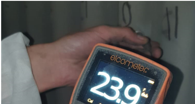
IGS HVTS thickness readings being taken

Following IGS' involvement, these CFB boilers have remained reliable, and IGS continues to work closely with the client to maintain pro-active management of boiler reliability. IGS works with plants to develop the right maintenance solution for their needs. IGS' deep understanding of material science and metal wastage mechanisms within boilers allows us to create a fit-for-purpose maintenance program, ensuring lasting boiler reliability.