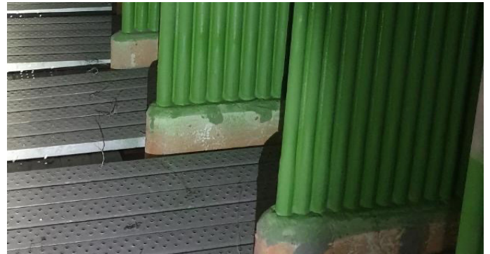
CFB Boiler panels protected with IGS HVTS